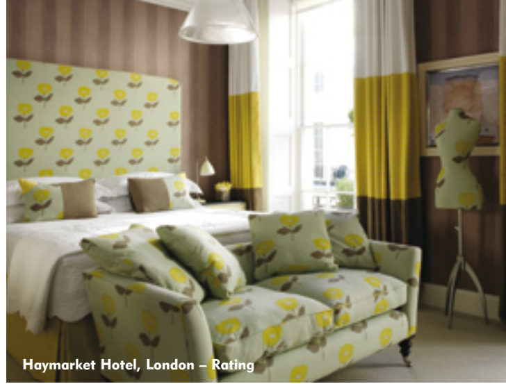
Haymarket Hotel, London – Rating