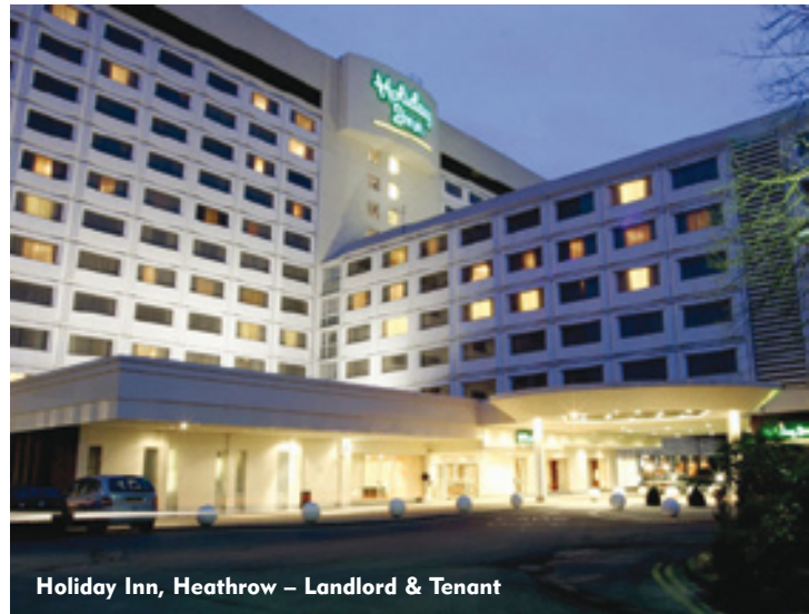
Holiday Inn, Heathrow – Landlord & Tenant