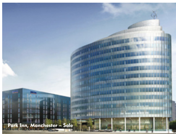
Park Inn, Manchester – Sale