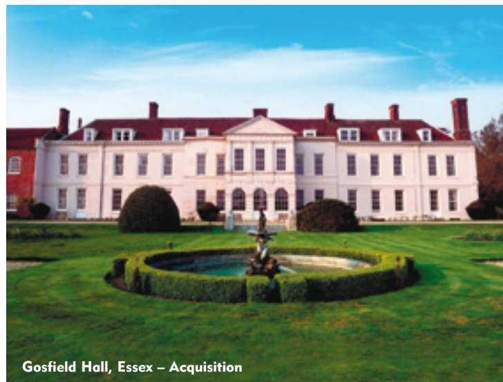
Gosfield Hall, Essex – Acquisition